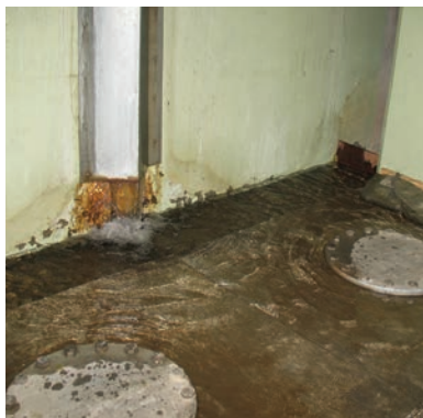
Dam monolith joint before repair.