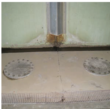
Same joint after CYLutions™ installation